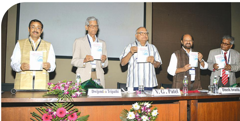
Emerging Trends in Entrepreneurship Research - Review of The Journal of Entrepreneurship

This glorious occasion also rewarded all the eminent contributors to the Journal.